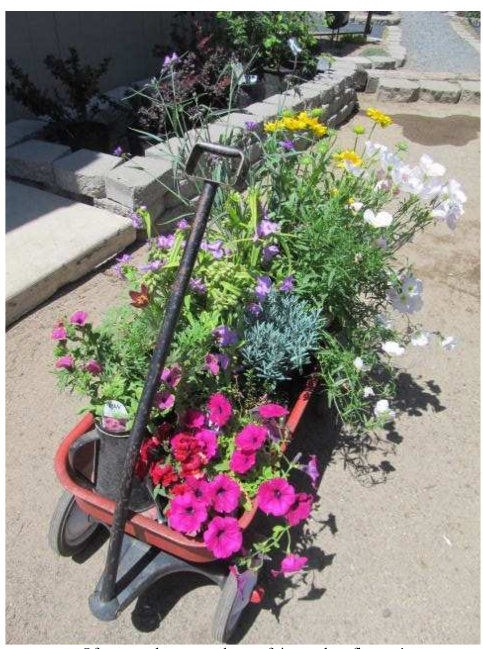
Of course, there was plenty of time to buy flowers!