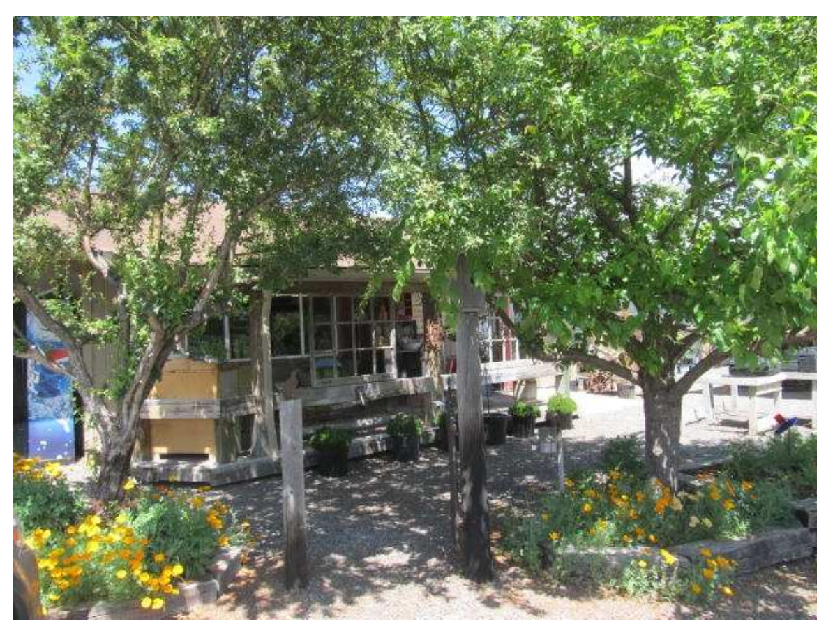
Front of L&S Garden store.