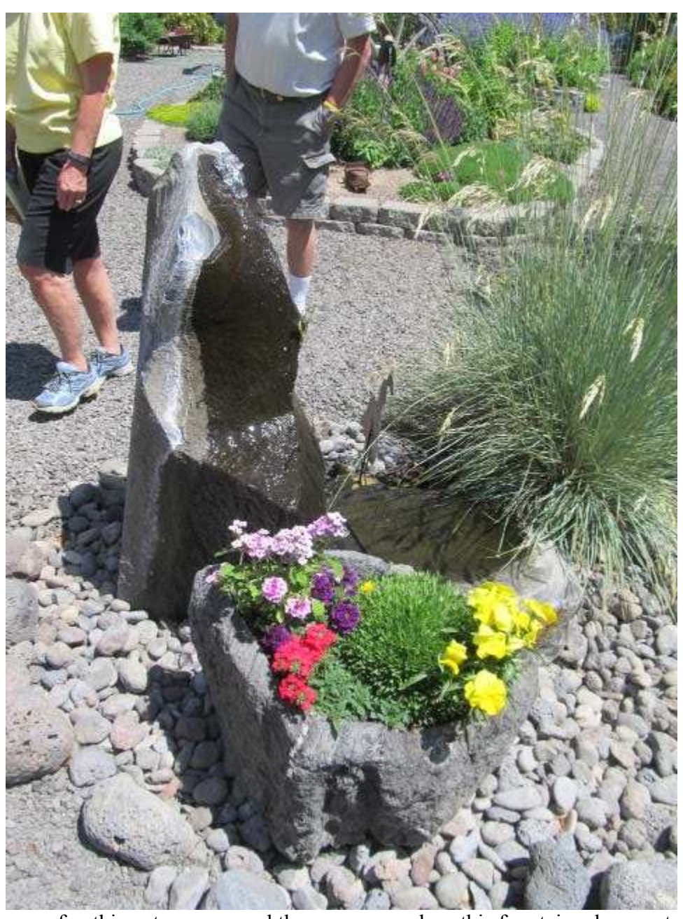
There were fun things to see around the nursery, such as this fountain where water runs down this stone slab.