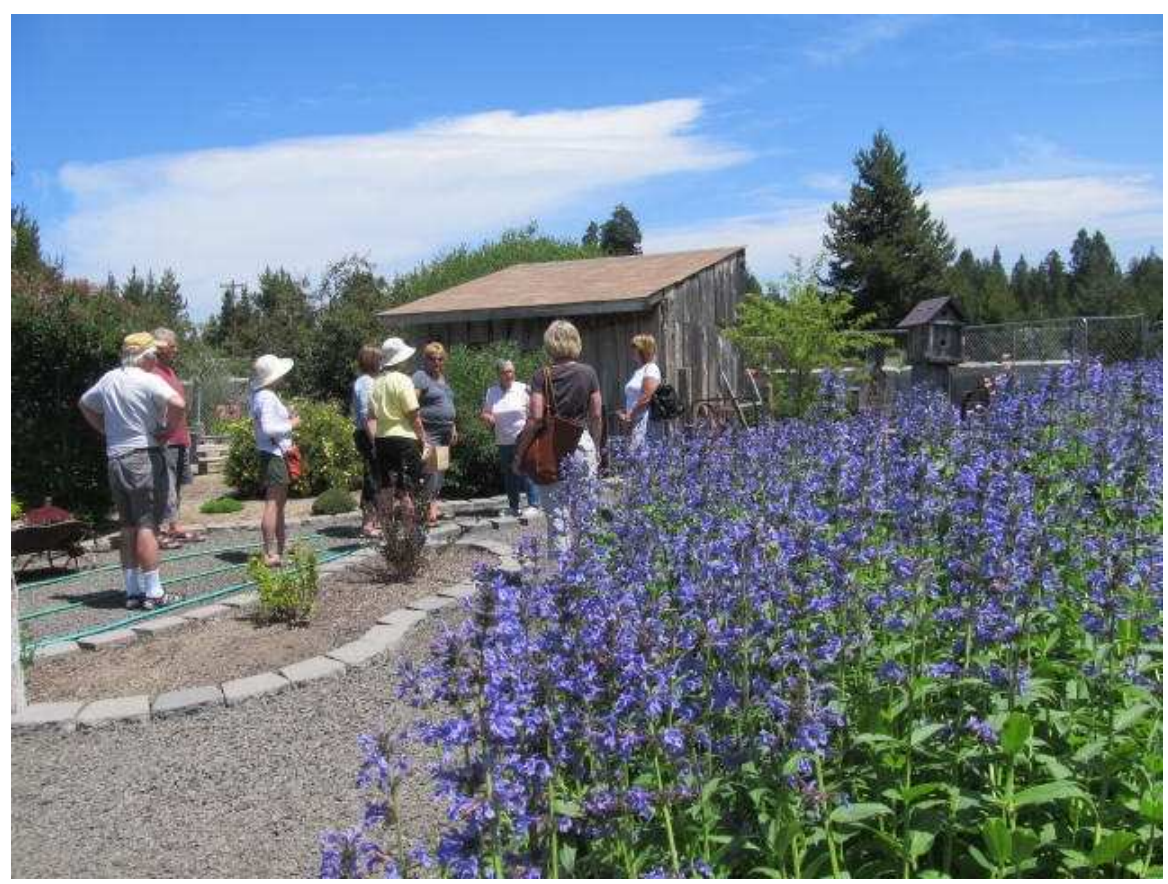
After lunch, we toured her gardens. The blue flower is catmint.