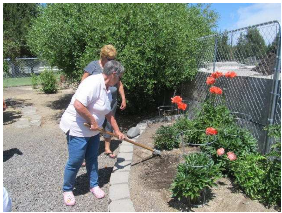
She demonstrates uses for the hula hoe.