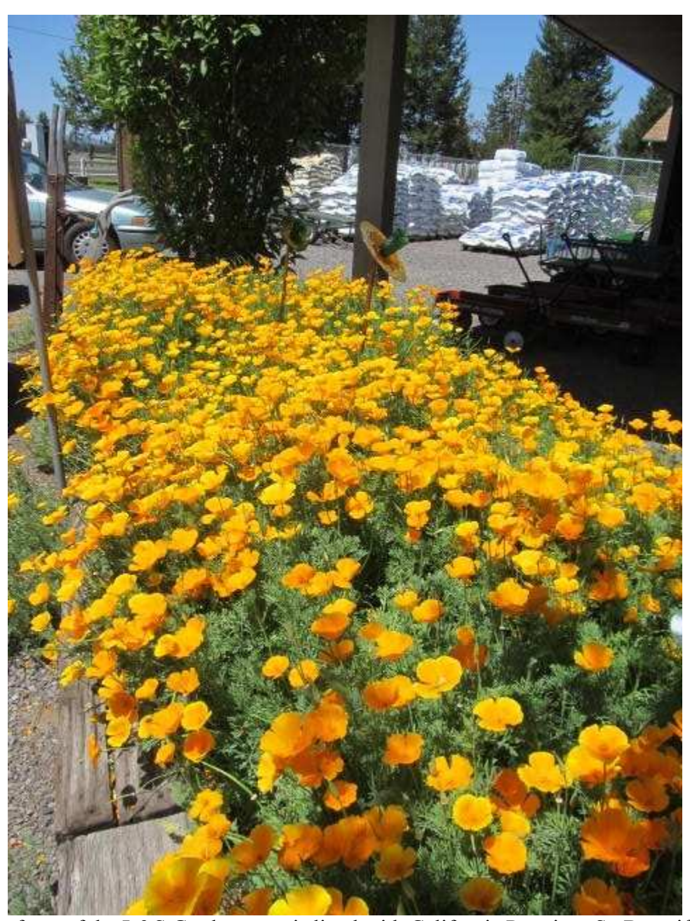
The front of the L&S Garden store is lined with California Poppies. So Beautiful!