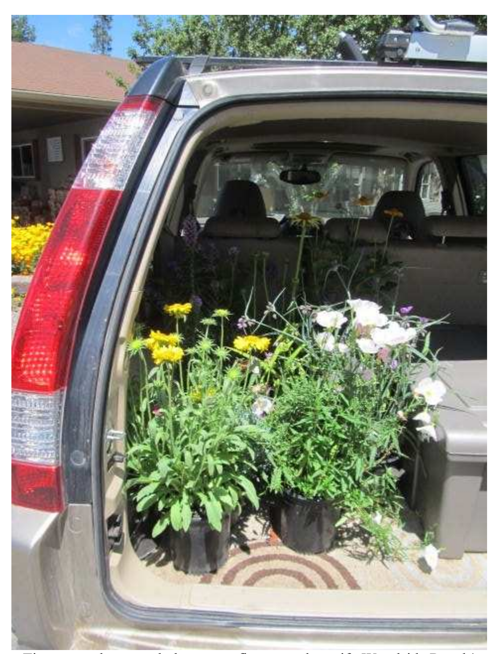
Time to get home and plant more flowers to beautify Woodside Ranch!