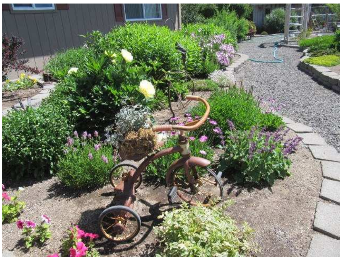
Everywhere one looks at L&S Gardens, there's something fun to see.