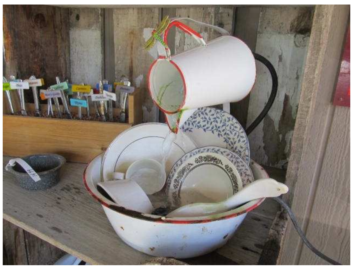
Fountain into a stack of dishes!