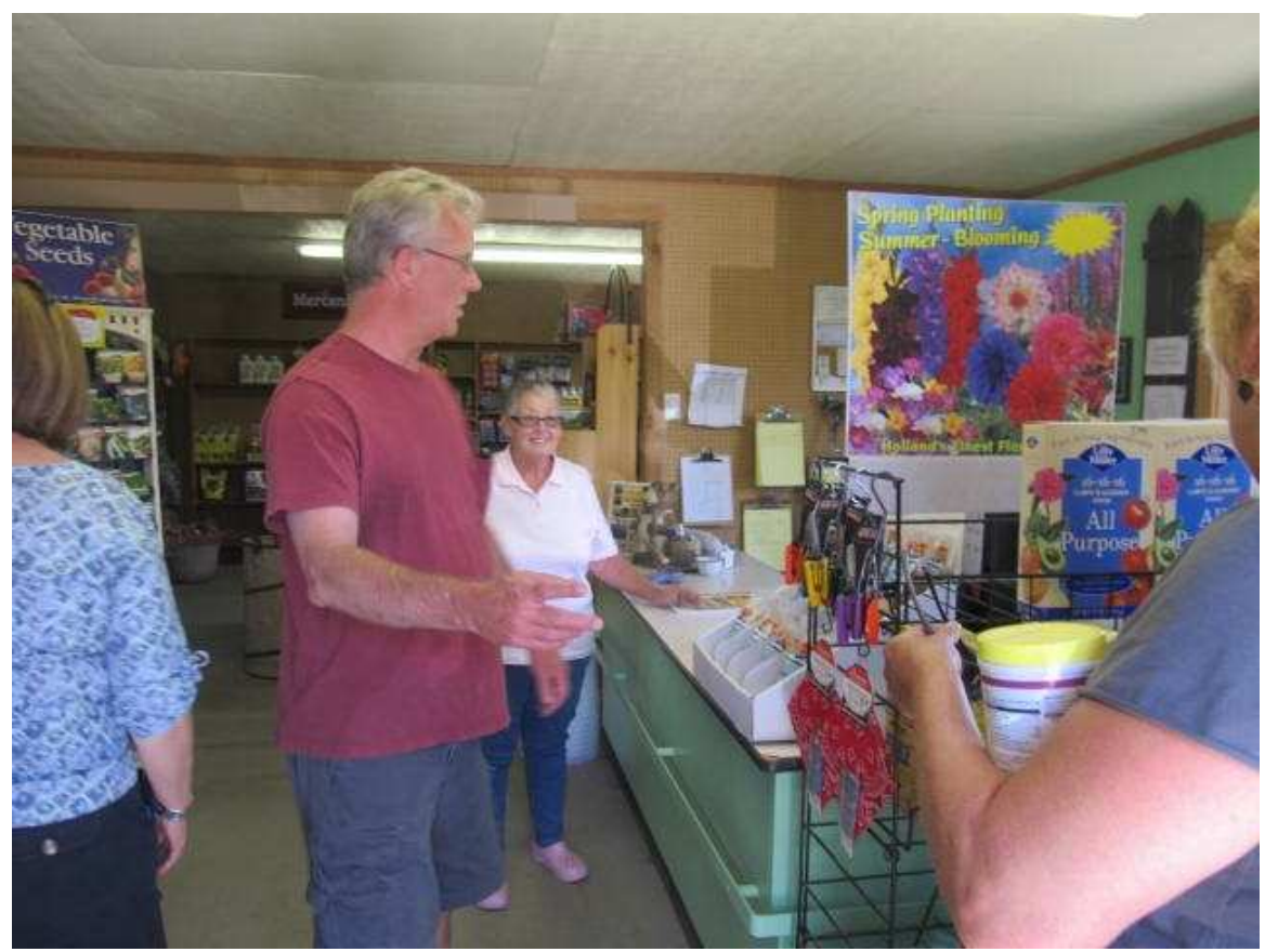
There was plenty of good shopping inside the store.