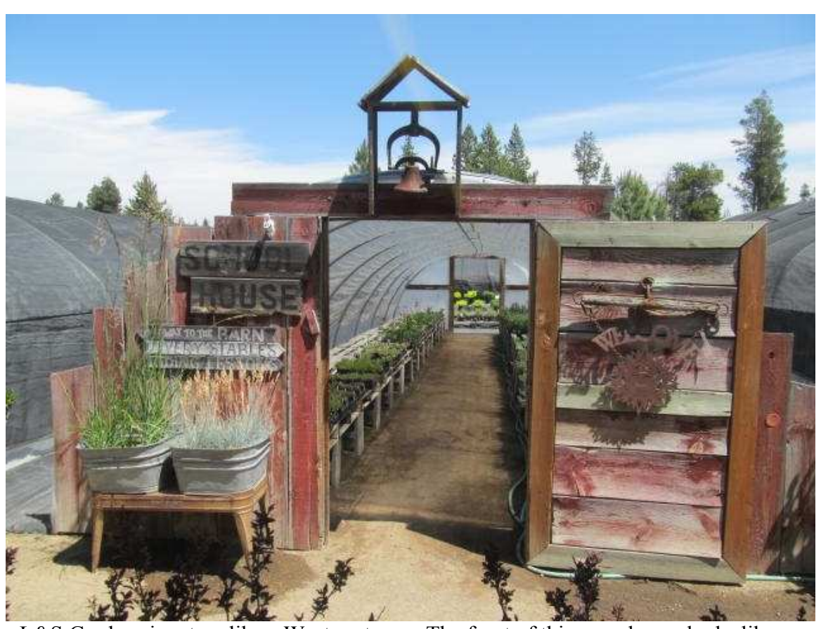
L&S Gardens is set up like a Western town. The front of this greenhouse looks like an old school house. Very clever!