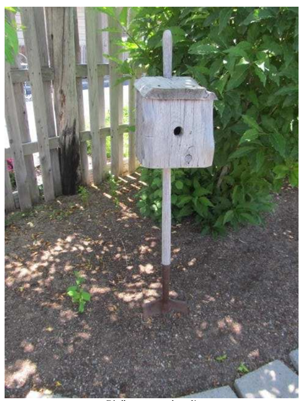
Birdhouse on a shovel!